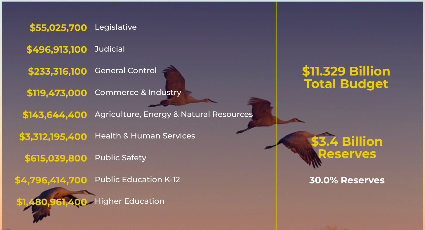
STATE OF NEW MEXICO RECURRING GENERAL FUND OPERATING BUDGET: YEAR OVER YEAR COMPARISON