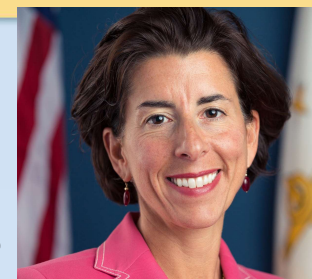
Gina Raimondo Secretary of Commerce