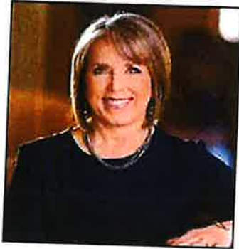
Governor Michelle Lujan Grisham's priorities