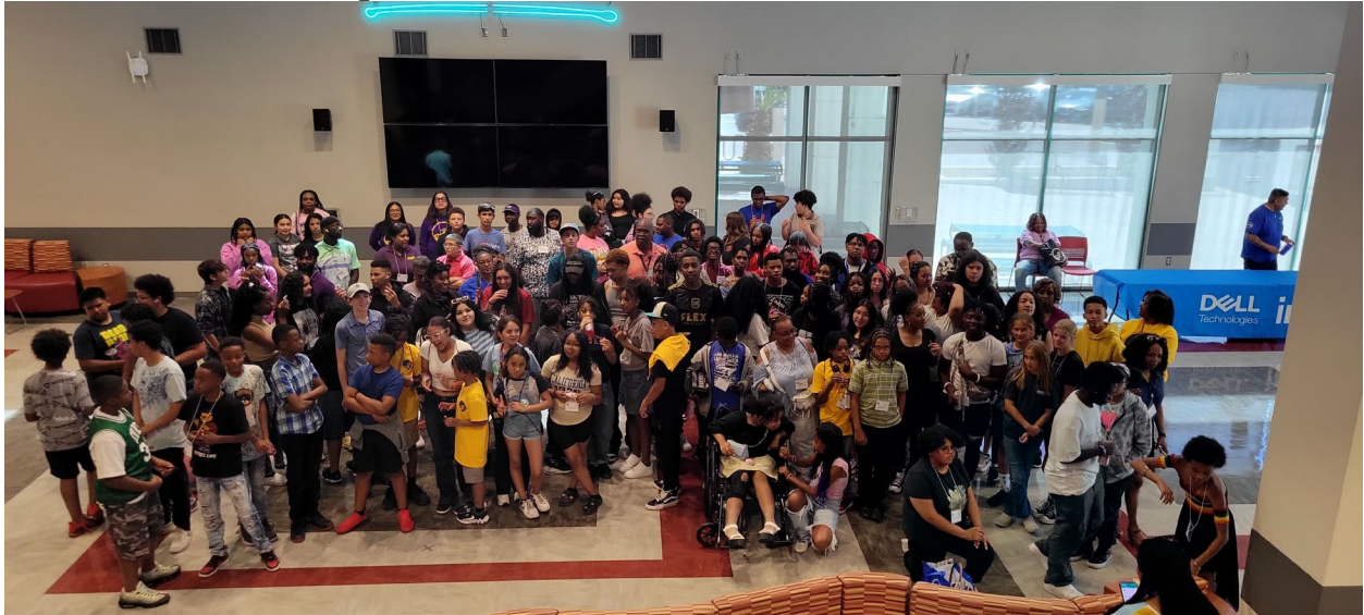
MLK March and Commemoration Ceremony